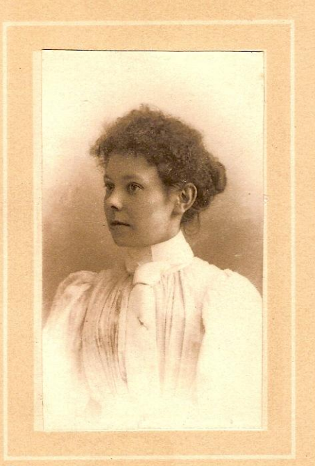
T. Steward & Co.,